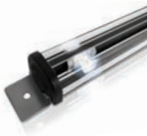
Optimax Pro 24